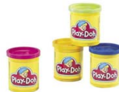
Dough, Doe, Play-Doh

Homophones are words that sound alike but have different spellings and meanings. Can you find a word in the title USES HER COMMON CENTS that has a homophone?